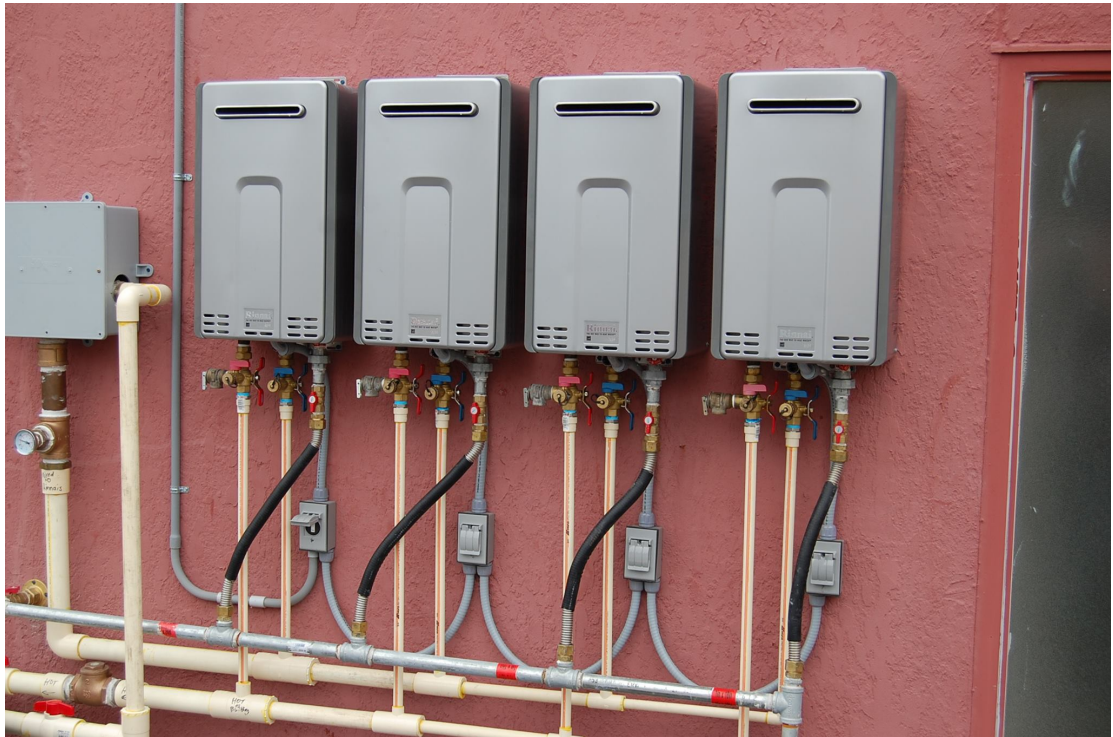
Flash Gas heaters backup on roof Sea Pine Resort Harbor Town Yacht Club Hotel HHI, SC.USA