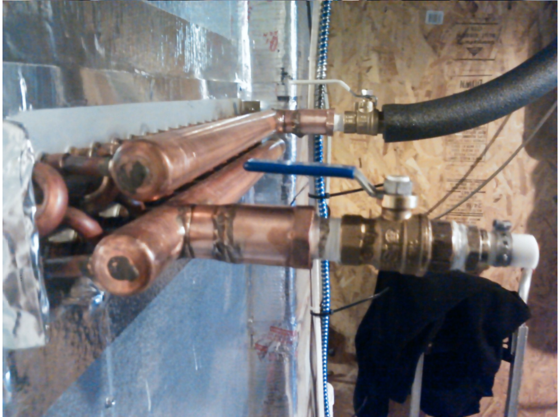
Connections from Central Heating Underfloor Manifold to Microsolar on roof.