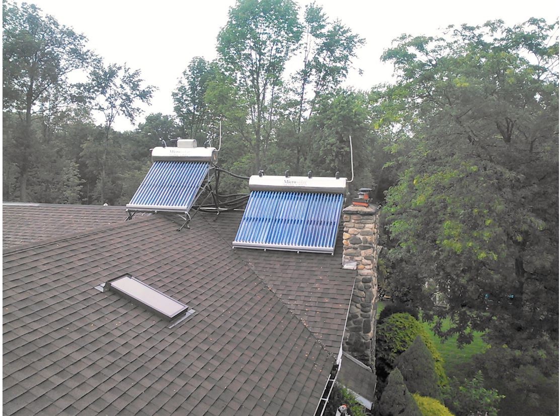
Morris, Pennsylvania, USA 2014 June by Affordable Fuels PA.