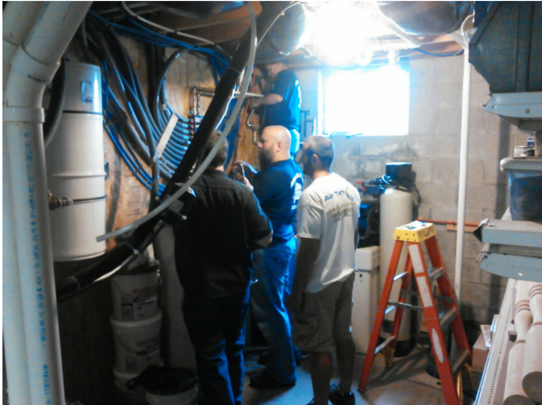
Installing the manifold connections from Microsolar to the underfloor central heating circuit