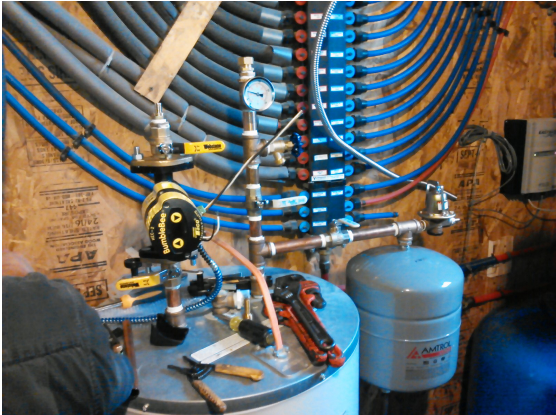
Installing the central heating underfloor connections to the Microsolar