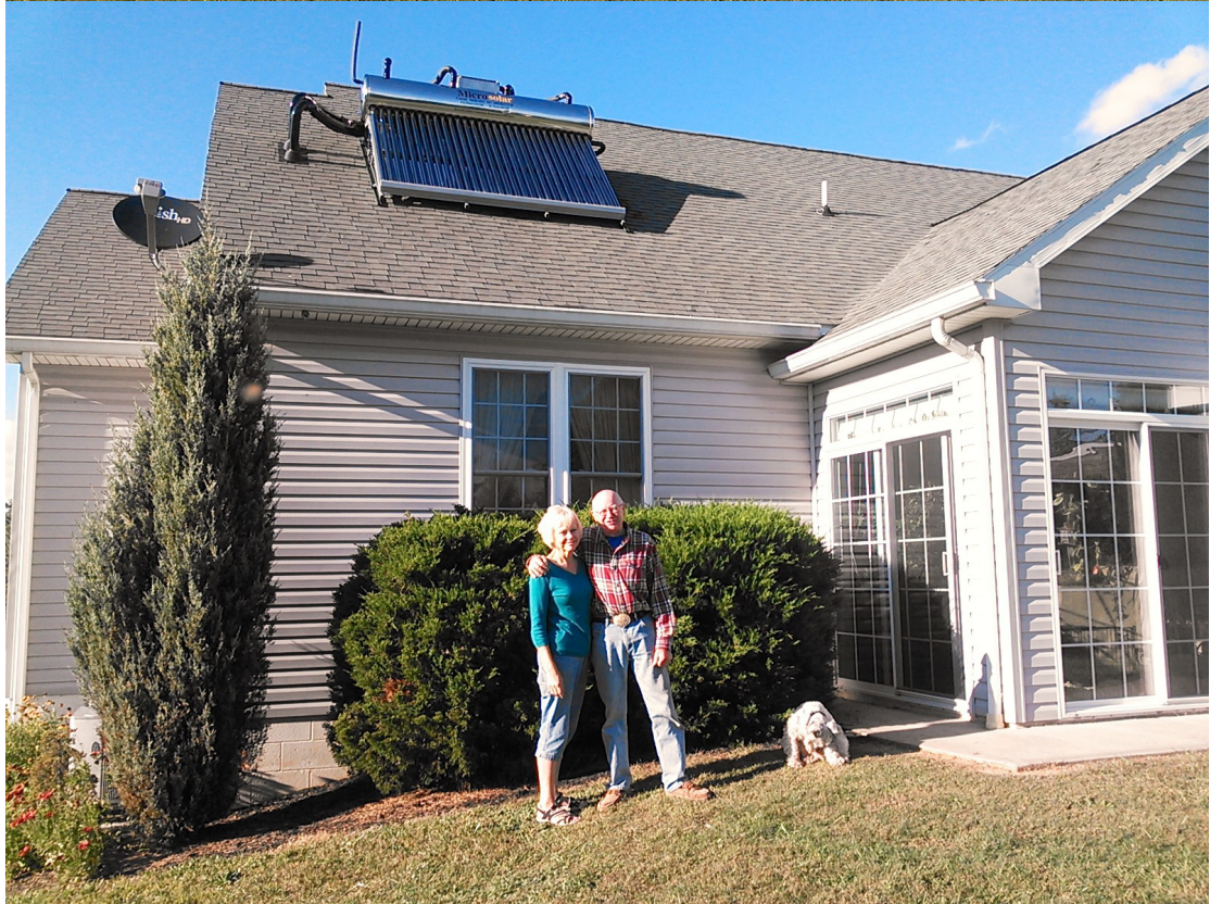
happy Basset residents with their dog and Microsolar, Sunbury, PA Sept 2014.