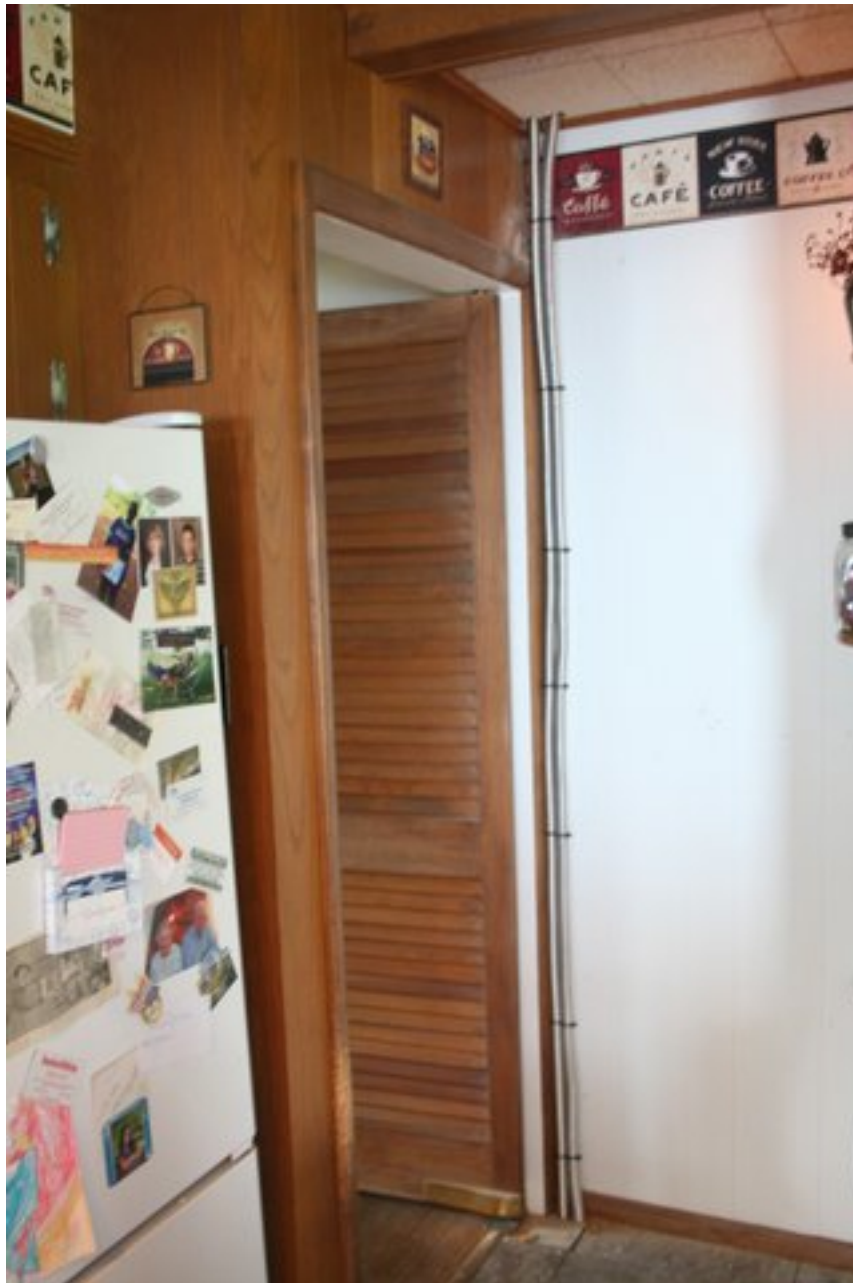
Potter House Middleburg PA. Stainless Steel pipe installed thru First Floor to Basement