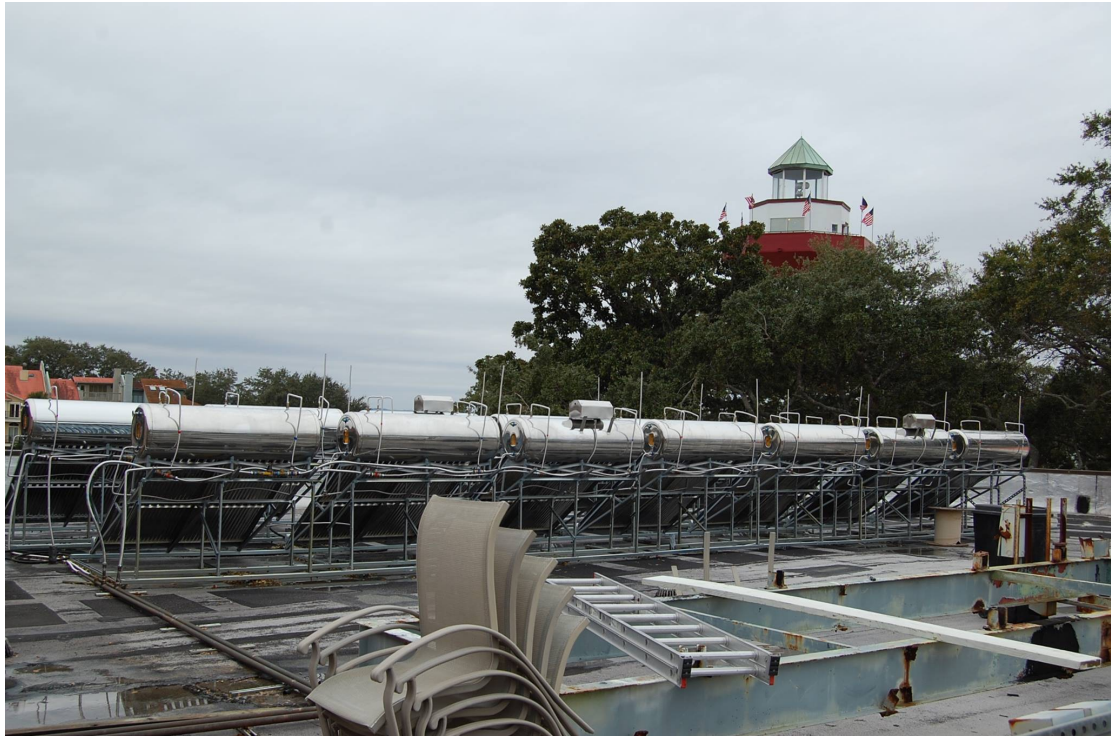
Microsolars at Sea Pines Resort Hotel, with Harbor Town Lighthouse HHI SC