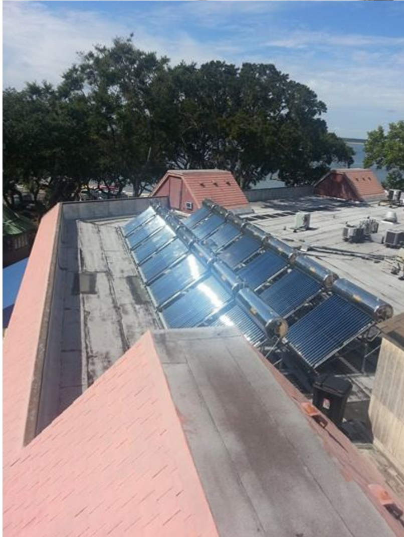
Harbor Town Yacht Club Hotel , Hilton Head Island , SC , USA 2013