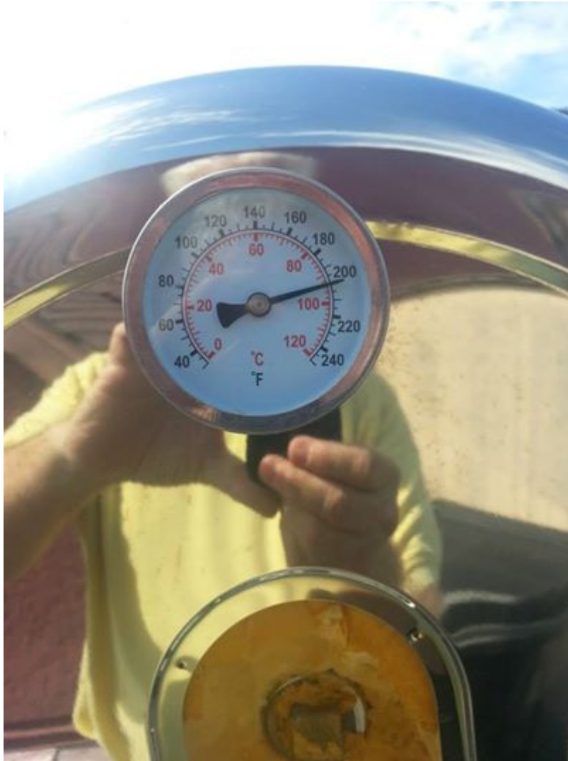
Temperature 200F/93C in the Microsolar tanks without any supplementary heating on the roof in Harbor Town Oct 2013 at Sea Pines Resort, HHI SC by American Microsolar.