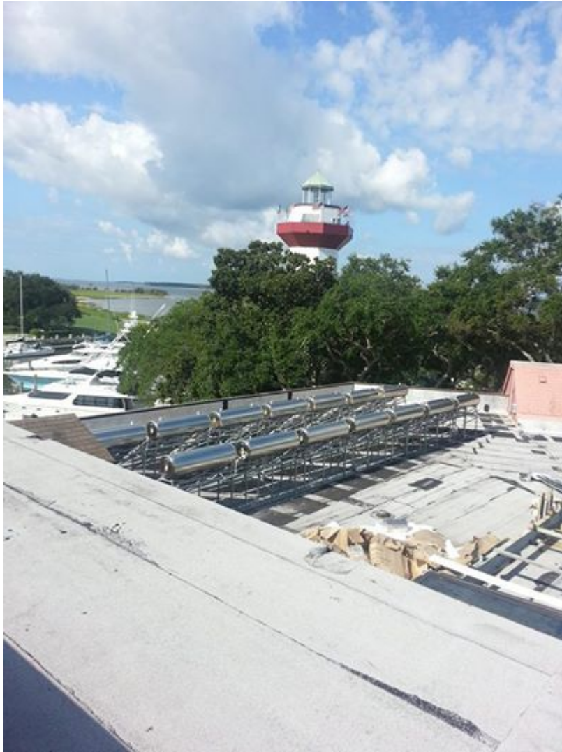
Microsolar Heaters at Sea Pines Resort , Harbor Town Yacht Club, Hilton Head Island , SC, USA 2013 with Harbor Town Light House behind. By American Microsolar