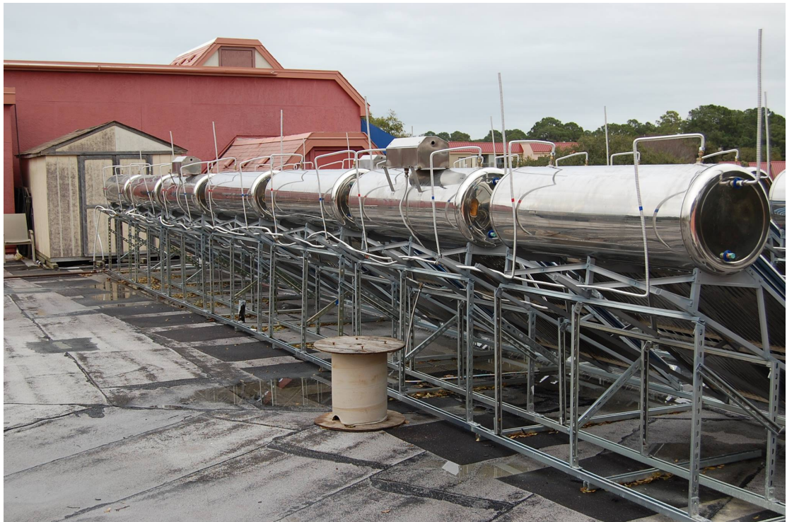
Microsolar Heaters at Sea Pines Resort , Harbor Town Yacht Club, Hilton Head Island , SC, USA 2013