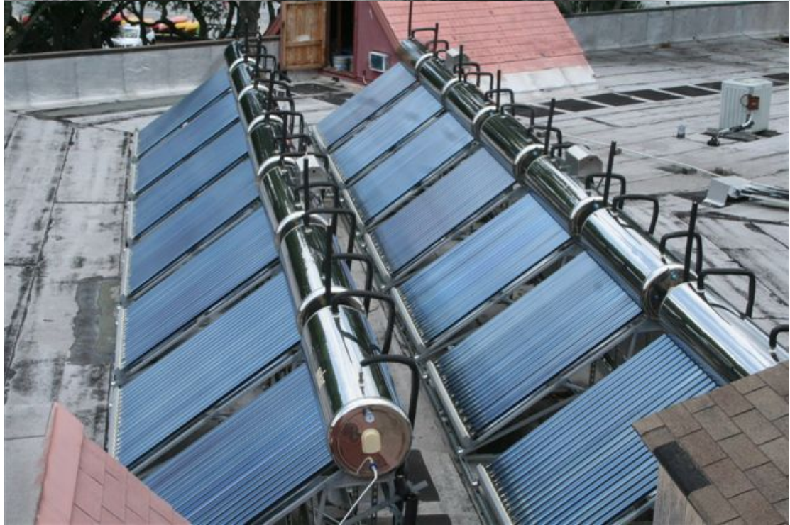
Harbor Town Yacht Club Hotel, piping on roof with flash gas heaters backup