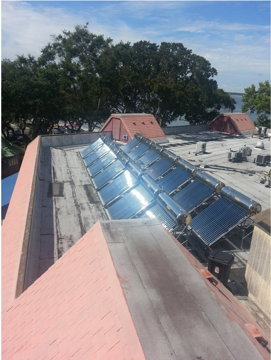
Sea Pines Resort Hotel, Harbor Town Yacht Club, Hilton Head island, South Carolina, USA.2013