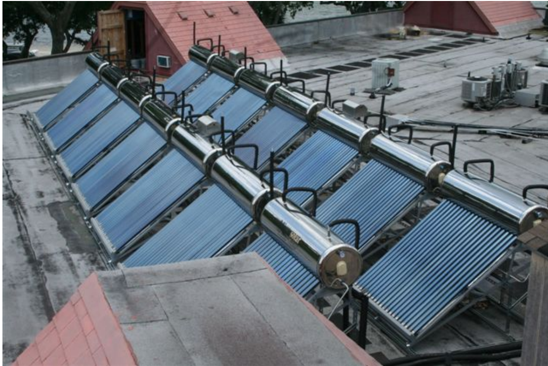
Harbour Town Yacht Club Hotel, Hilton Head Island SC 2014 one year later after installation in 2013.

For more details please see Facebook “Microsolar System Water Heaters”