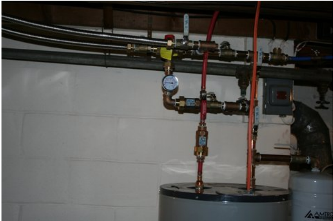
Potter House, Middleburg PA, right turn to connect to Temperature Control Mixer Valve