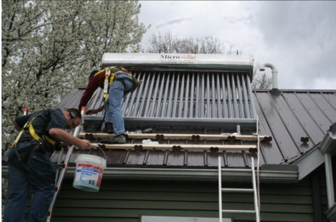
Potter House, Middleburg PA May 2014 Filling the Microsolar heater. By Affordable Fuels PA.