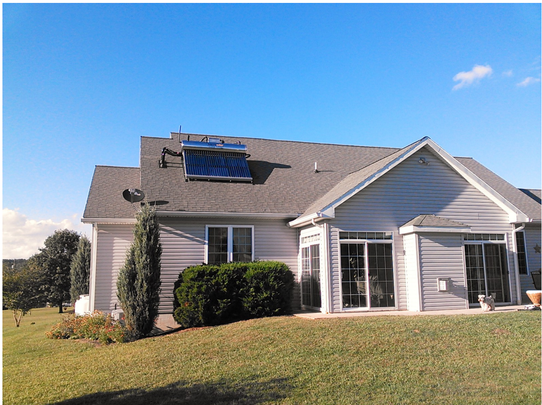
Bassett Residence, Sunbury PA Sept 2014