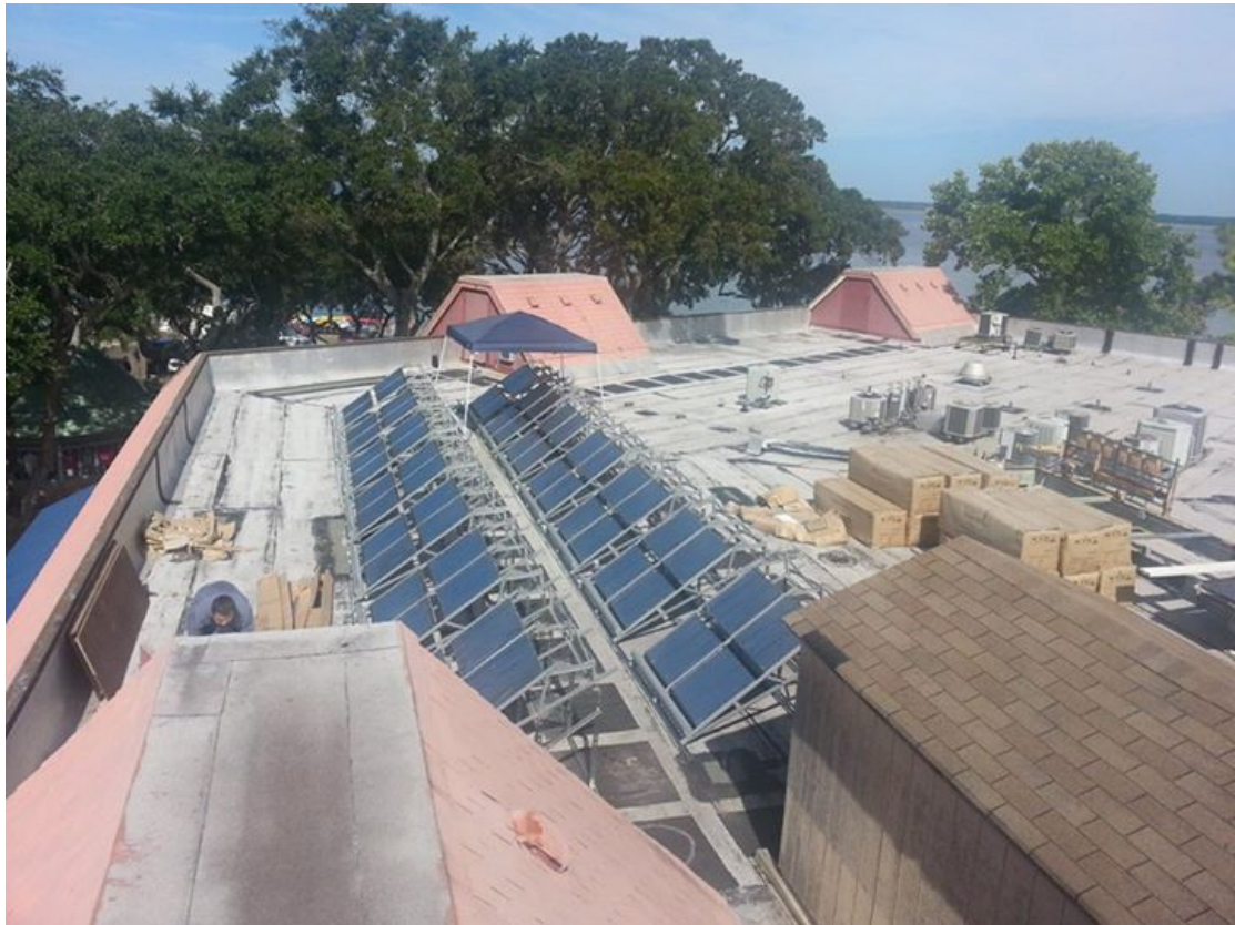
Harbor Town Yacht Club Hotel installation in 2013, Hilton Head Island SC, USA by American Microsolar