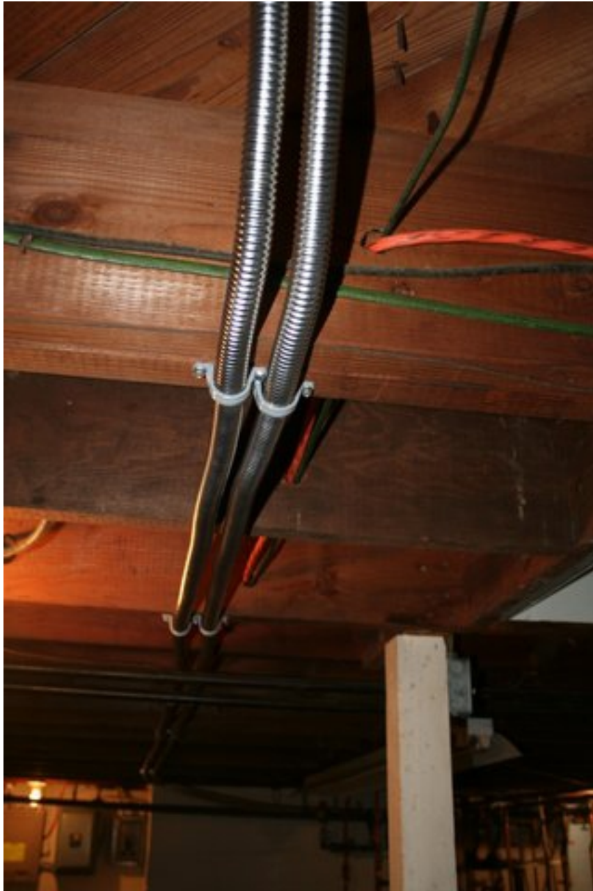
Potter House Middleburg PA . Exit between floor joist to basement